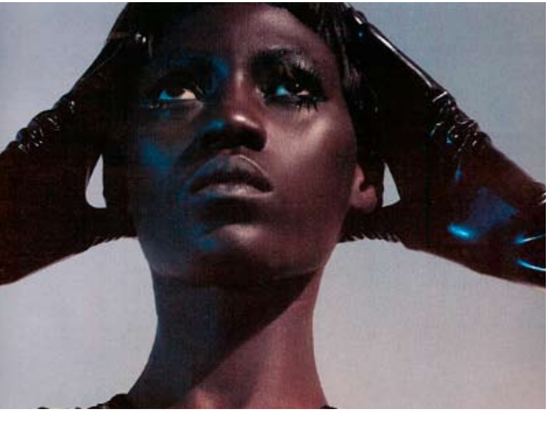
TOUCH HUMAN A provacative experience that celebrates the sensorial world of touch in a multi-media /performance art installation that is softly sensual, elegantly provacative and intimately human.